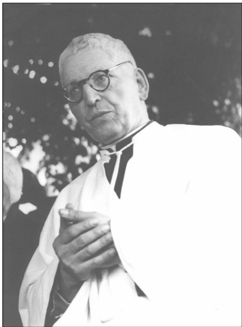
The servant of God Mons. Joaquim Alves Brás